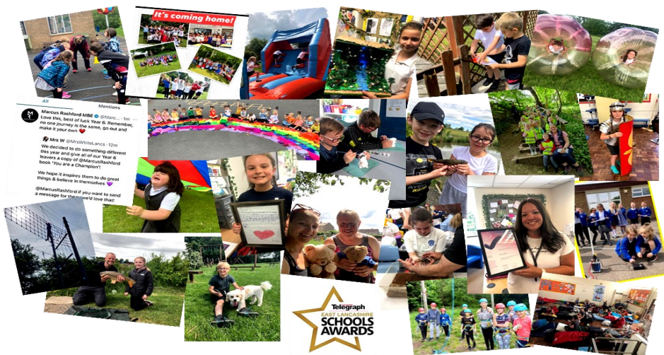
Snapshots of Summer Term 2021