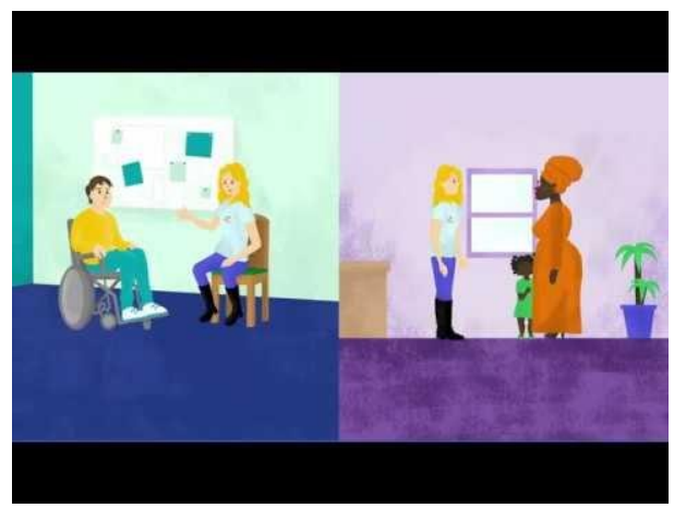
3 - This video gives a good understanding of the support on offer to you through the SENDIASS service.